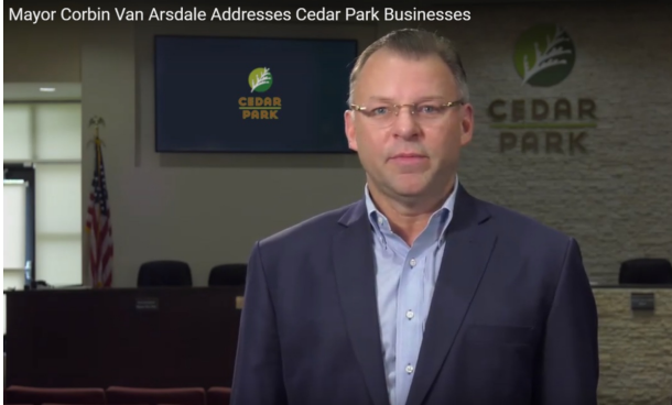
Mayor Corbin Van Arsdale Addresses Cedar Park Businesses