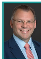
Mayor Corbin Van Arsdale

ASK US! Wednesday, January 27 6:30-8:30 P.M.