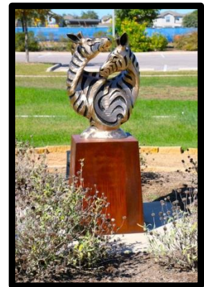
Matching Pair By: Dan Pogue

The Cedar Park Arts Advisory Board will accept entries of large scale, free standing and interactive sculptures and welcomes all artists- professional, amateur and student. Each artist may submit up to 3 pieces for consideration. All works must be of original design and execution and must be available for installation during the designated installation period (Oct. 1-7, 2016). At the end of the loan period, the city will consider seeking public input regarding the selection of a piece to purchase for inclusion as part of the City's permanent collection. The pieces selected for display will be chosen by board members based on the originality of the piece, its aesthetic properties, its suitability for an outdoor public exhibit, and since the City hopes to purchase a sculpture, the sales price of each piece will also be considered during the selection process. If the item is listed as being for sale, the artist must agree to sell it to the City for the sales price they have indicated on the entry form.