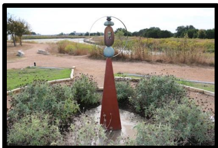
Zen Balance By: Warren Cullar

In order to be considered, please submit the attached entry form and digital photos of each piece (or digital photos of a scale model), by no later than May 27, 2016.